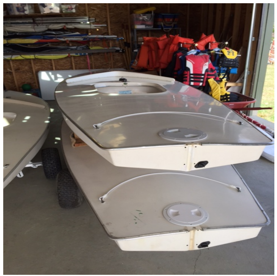
Squeaky clean, shiny Sunfish after pressure wash, polish then buffing!