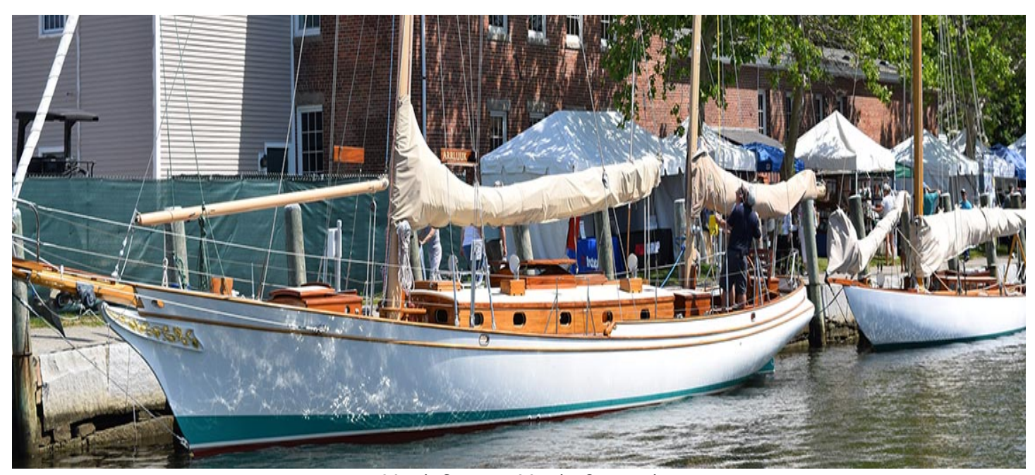
Mystic Seaport, Mystic, Connecticut