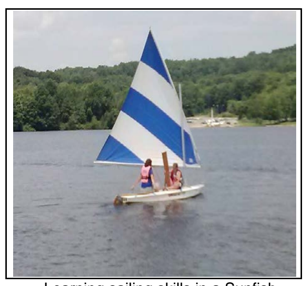
Learning sailing skills in a Sunfish