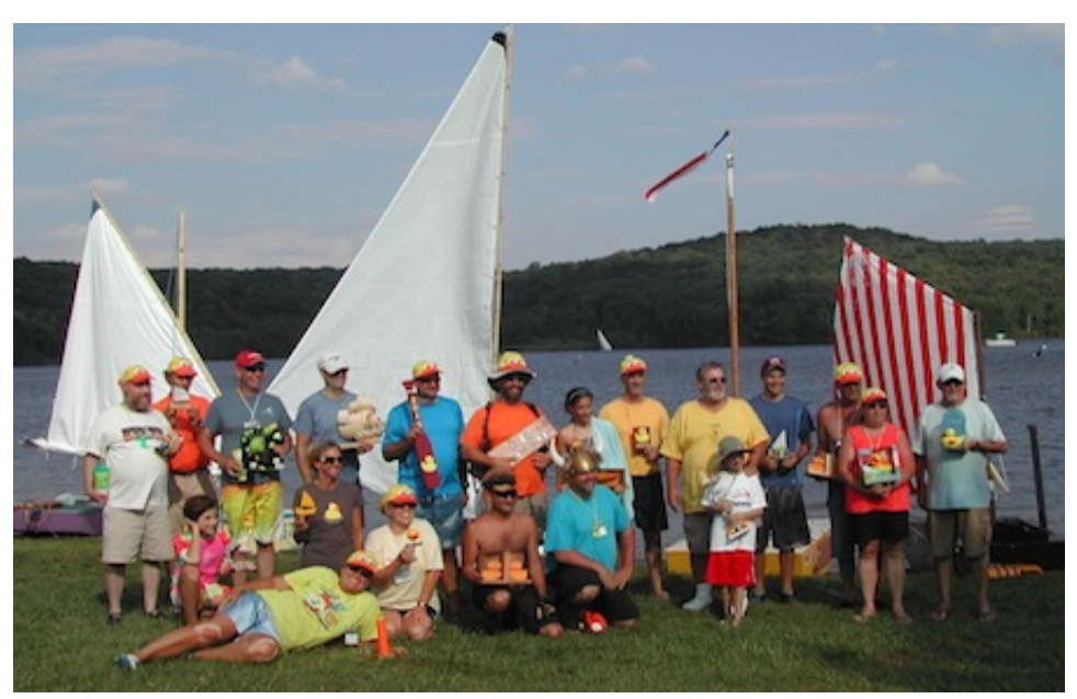
Pictured are the 2012 World Puddle Duck Racer trophy winners.

Following the Puddle Duck tradition, each registrant is asked to provide a trophy for selection during the awards ceremony, which takes place, Sunday, August 2, 2015. The last World Puddle Duck Racer Championship held here was in 2012.