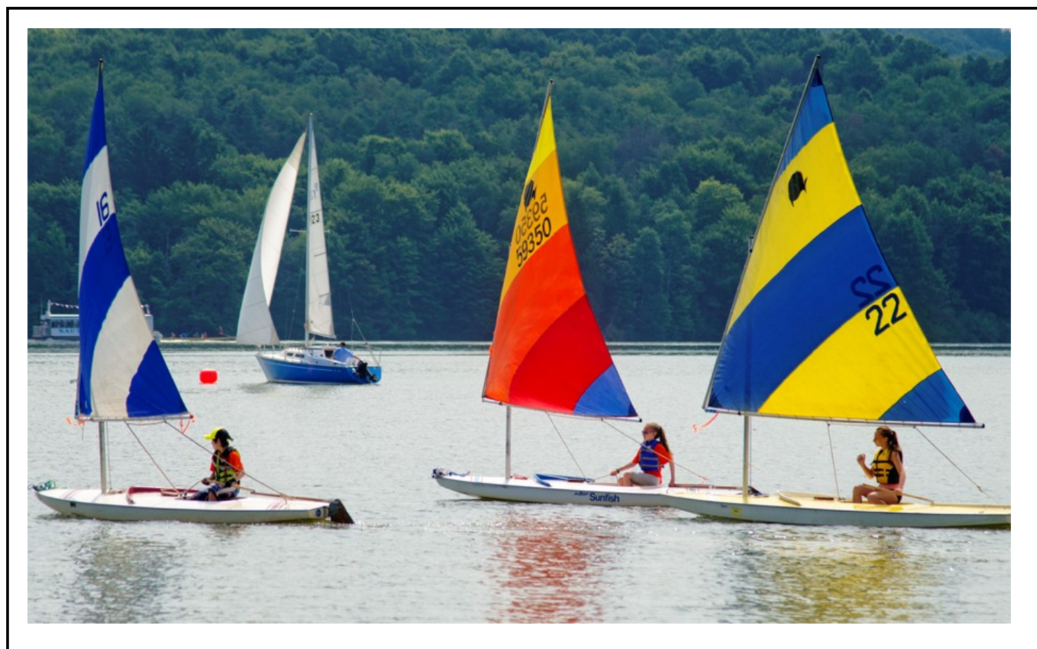
More Regatta fun and Sunfish Racing on Lake Arthur