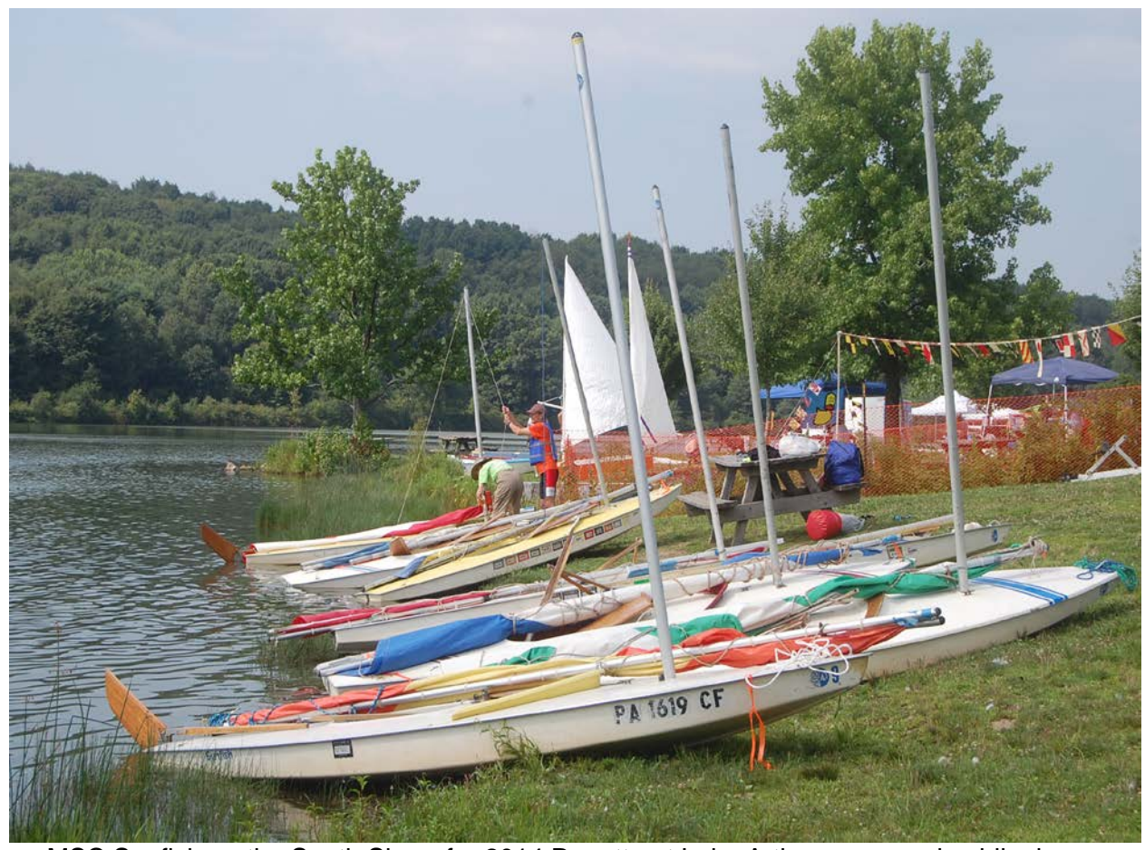
MSC Sunfish on the South Shore for 2014 Regatta at Lake Arthur races and public demos.